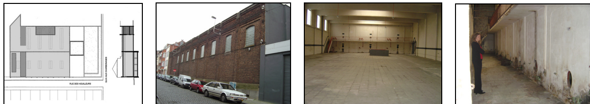
Figure 1. Existing building: plan/section – facade – internal hall – wine barrels

First, instead of focussing on the students' results of this assignment, attention is shifted towards their design process. During the design, students are encouraged to make a detailed analysis of the existing building, its constituting elements and characteristic aspects. The graphical output of these individual analyses is immediately made available to all students through the universities' digital education platform. All discovered interesting aspects of the existing building are thus collected, eventually forming a knowledge base about the building.