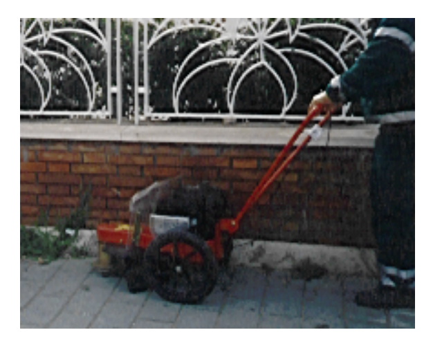
Figure 3. The fist prototype of the MS