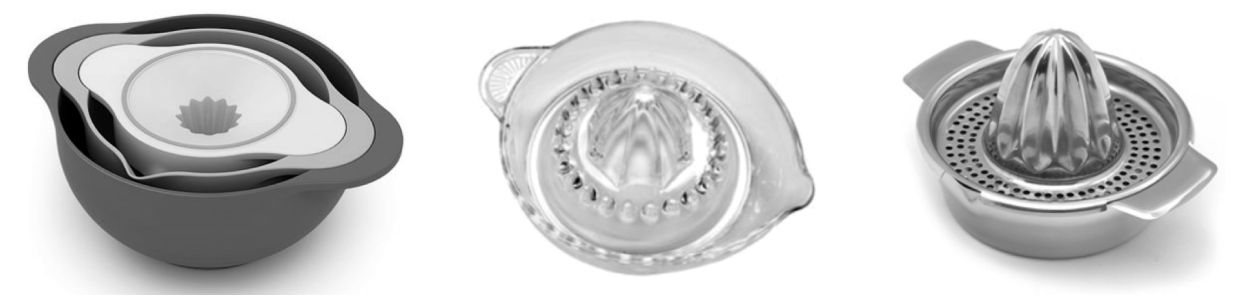
Figure 1. Fruit juicers manufactured from different material families

To elaborate by means of an explanation, in Figure 1 three types of fruit juicer can be seen: each made from a different material family (plastic, glass and metal respectively). Each is a valid marketable product and will be attractive to certain cross-sections of the population. This begs several questions: why are people attracted or repulsed by products in certain materials? what drives their material reactions and experiences? and how can we be sure to select materials that people will love, and avoid those they will hate? These are the kinds of materials questions that are of concern to an industrial designer, and it is through a user-centred approach to materials selection that answers can be generated.