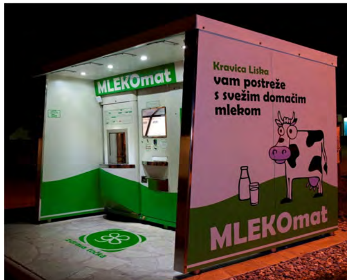
Figure 2. Developed mechatronic system – vending machine for milk

The vending machine for milk (Figure 2) constitutes one of the modules of a future automatic marketplace that performs one of the phases of the process ranging from hay production to the sale of milk.