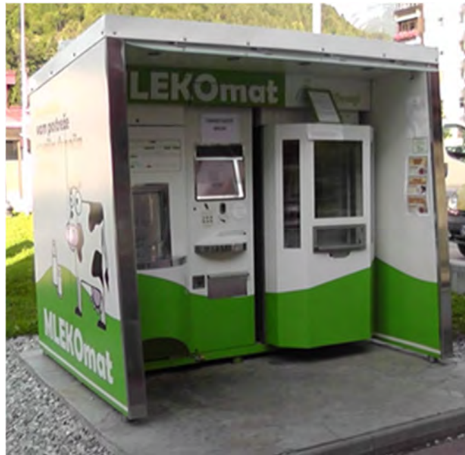
Figure 3. Modules for the sale of eggs and bread added

In short, the presented case indicates that virtual team members should have appropriate technical and professional competencies. They should have an introductory face-to-face meeting (if they have not collaborated previously), they should have good command of ICT use and should follow a systematic developmental process. These findings (although based on a limited case) are in line with the findings of many virtual team studies e.g. [IJsendoorf 2002], [Rezgui 2007], [Oguntebi 2009]. The above-mentioned limitations of the case most likely originate from the fact that there were no cultural differences between virtual team members, no time differences in terms of time zones and no foreign language issues. It has been indeed reported that these types of issues create barriers within virtual teams [Daim et al. 2010].