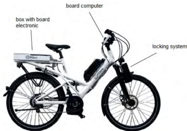
Figure 2. Pedelec with board computer, board electronics and locking system

A student sub-project within PSSycle aimed at developing a feasible locking system prototype for the e-bike that had to fulfill the following requirements: