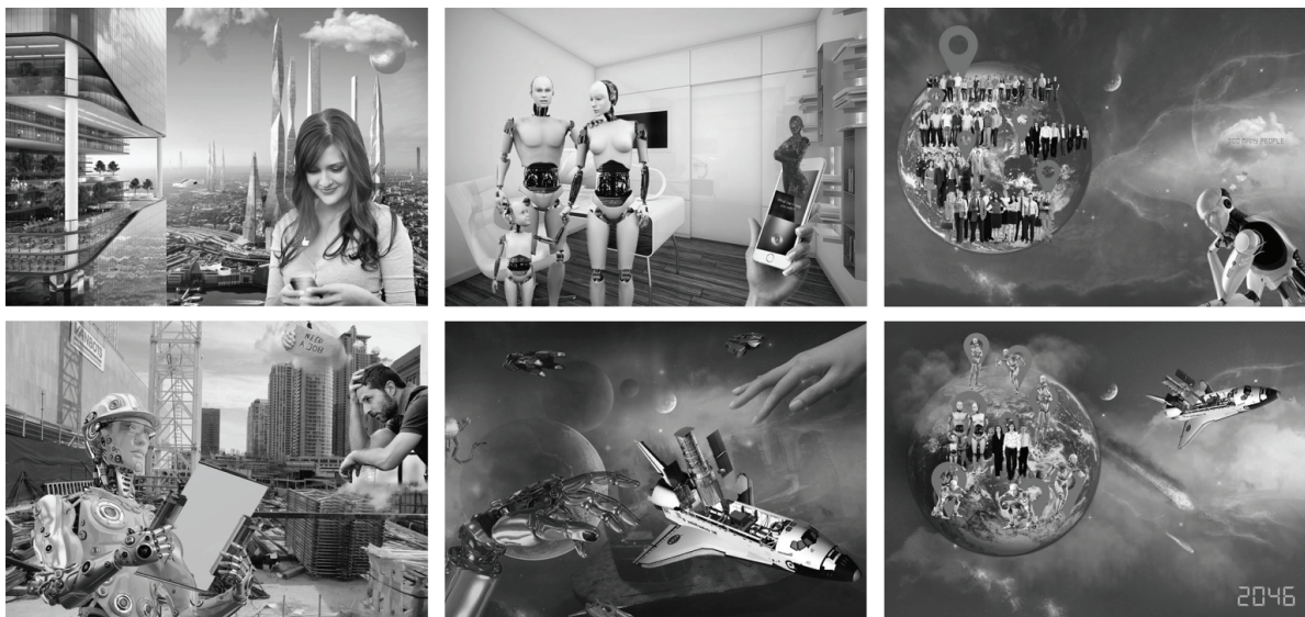
Figure 3. Media and communication. School project Media 2046. Student project work

In a teaching situation where students get to work with future scenario building, opportunities to see products in a larger context might facilitate a greater understanding of topics such as consumption and environmental impact. In the words of a student: "I didn't think much about it [...] Now that I get all this down on paper, I think it's much more important than that". We question whether this approach can provide the students an opportunity to see the challenges and problems within an overall context and whether it can prevent the alienation of issues and topics such as sustainability.